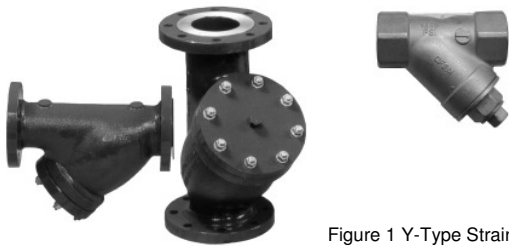
Figure 1 Y-Type Strainer