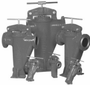
Figure 1 Mono-in-Line Strainer