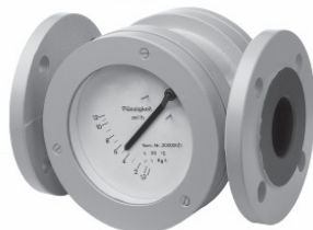
Figure 2 TM Prima flap flow meter for opaque liquids