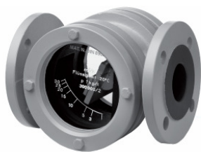
Figure 1 TM Intra flap flow meter for transparent liquids